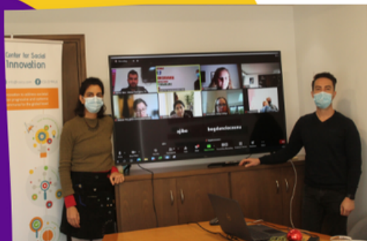
TPM, December 2021

Internally, on December 16th CSI hosted the first hybrid Transnational Partner Meeting in Cyprus. The consortium had the chance to report their progress and set new tasks and goals regarding the project.