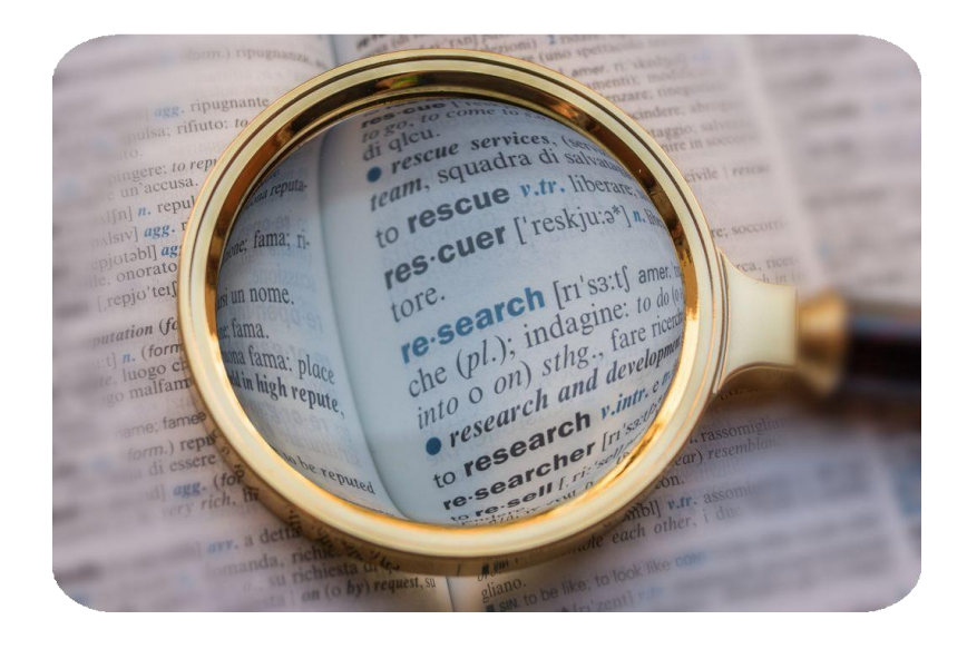
PROJECT PARTNERS NEWS: "OLYMPIC TRAINING & CONSULTING LTD"

During the month of January 2020 each Project partner designed a report based on the research on the gaps and needs analysis realized in their countries. The partners integrated then the national reports into one comprehensive document, (Report on gaps and needs analysis) summarizing the needs and gaps to the DigiCompEdu framework. This comparison resulted in the specific description of needs to be addressed through the DIGITA project and the overall learning objectives.